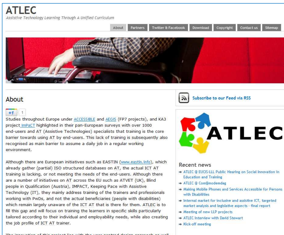
Figure 7: ATLEC project website homepage