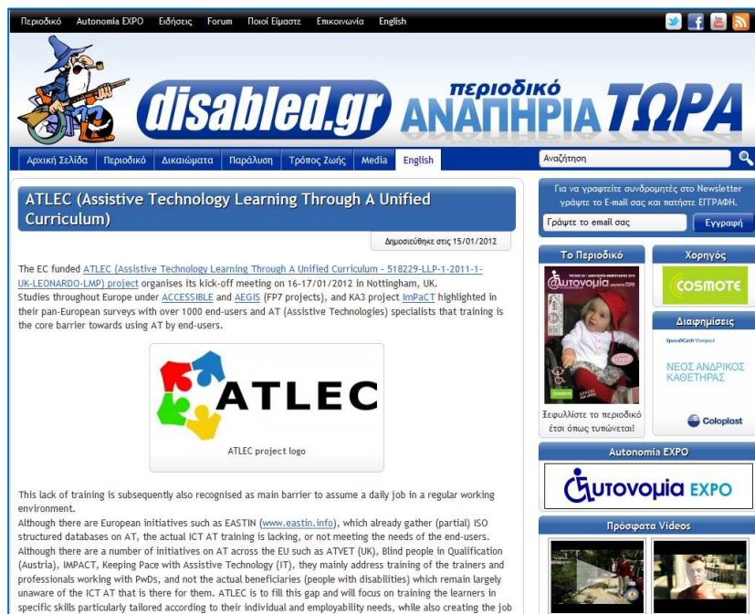
Figure 10: ATLEC in DISABILITY NOW website (www.disabled.gr)