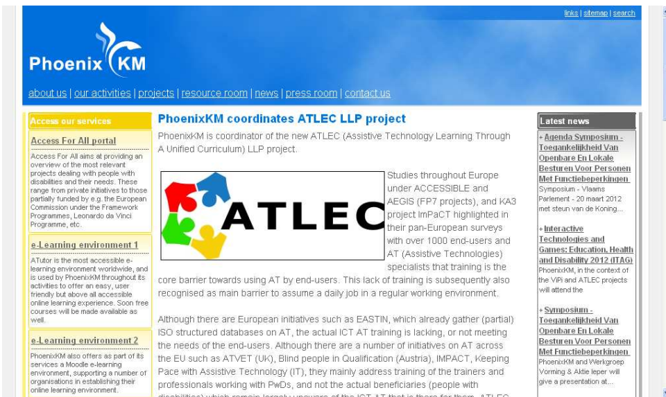
Figure 11: ATLEC in PhoenixKM website (www.phoenixkm.eu)