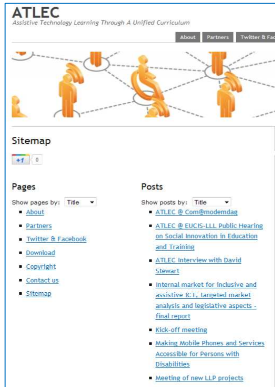
Figure 8: ATLEC website sitemap