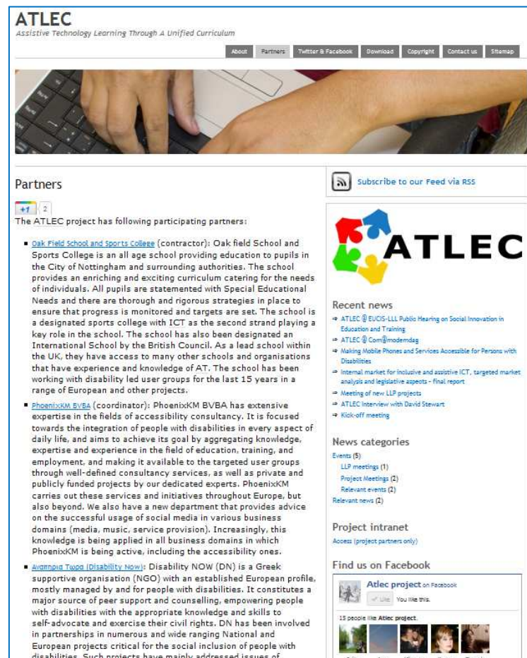
Figure 9: Partner Description Page in ATLEC website