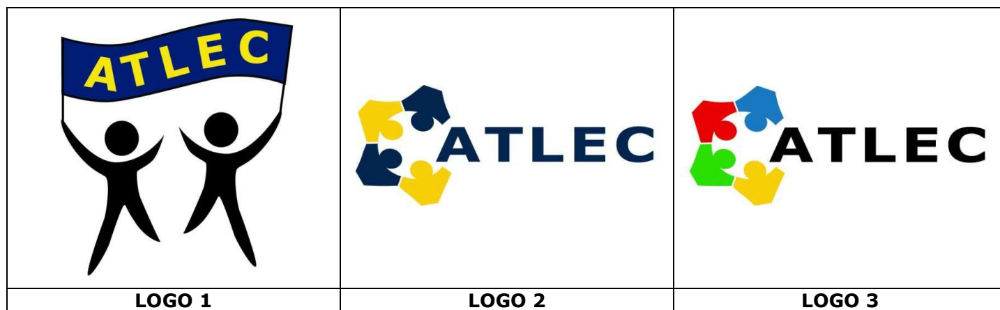
Figure 5: ATLEC Logo proposals